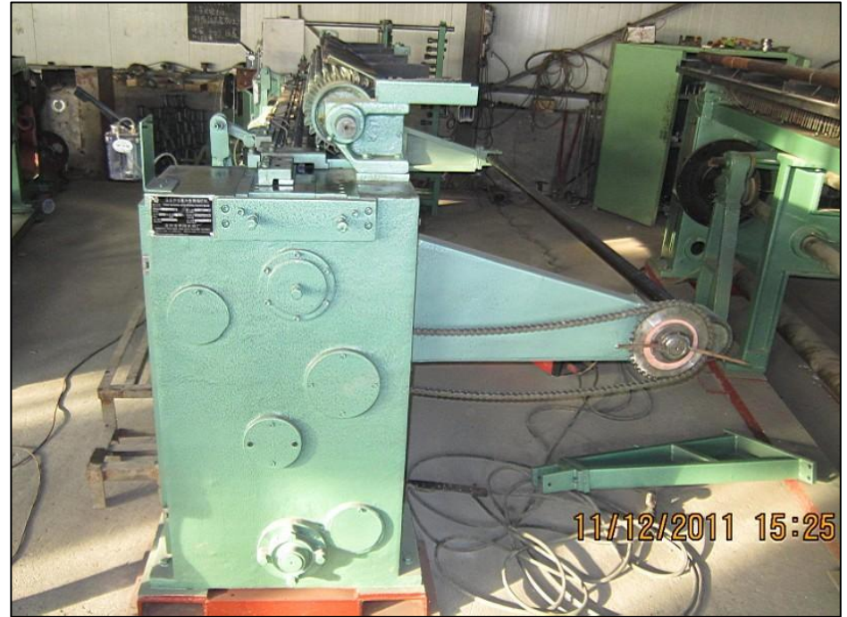
Lateral of the machine