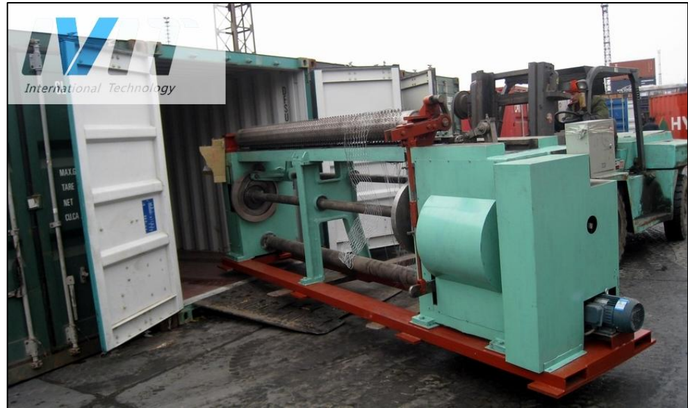
Machine for exporting