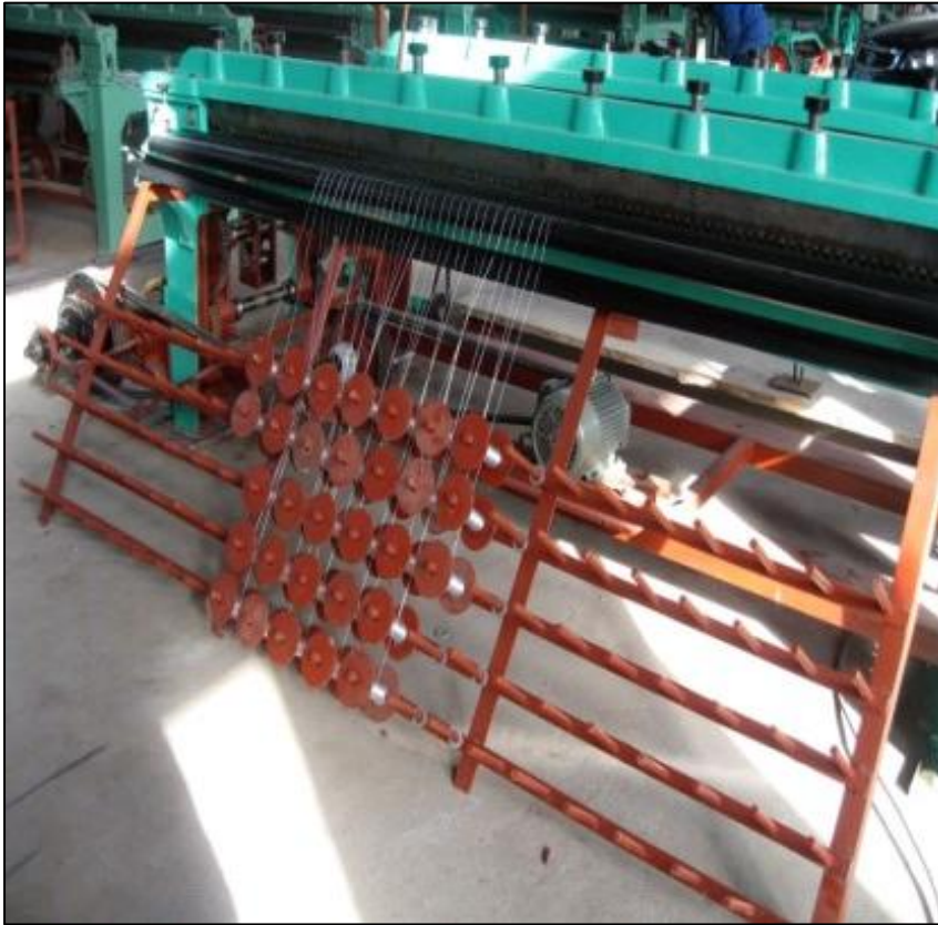
Back of the machine