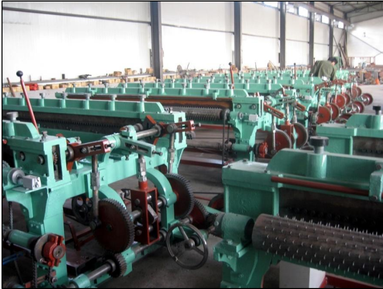
Machine in stock