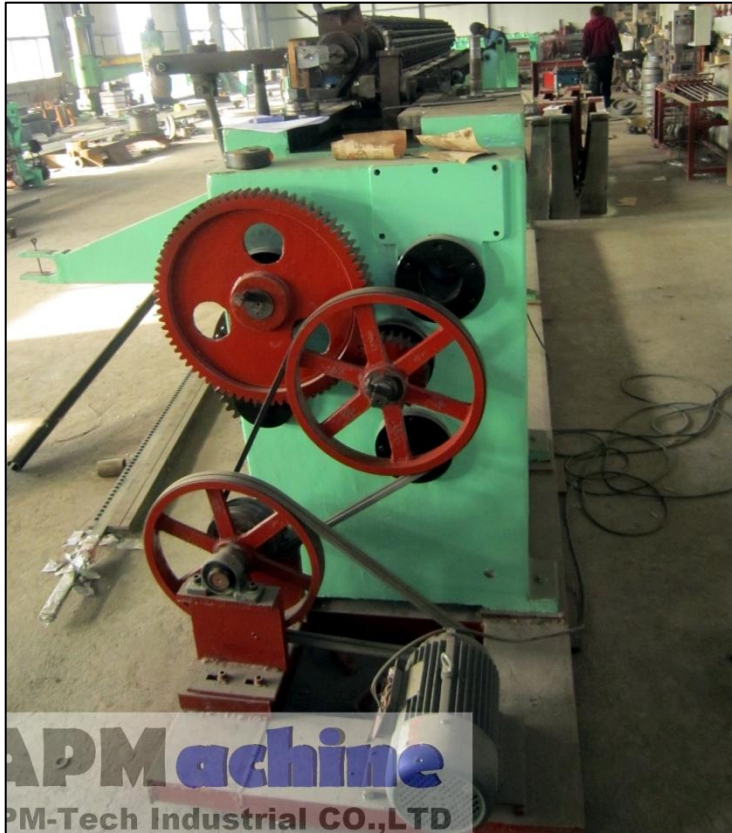
Lateral of the machine