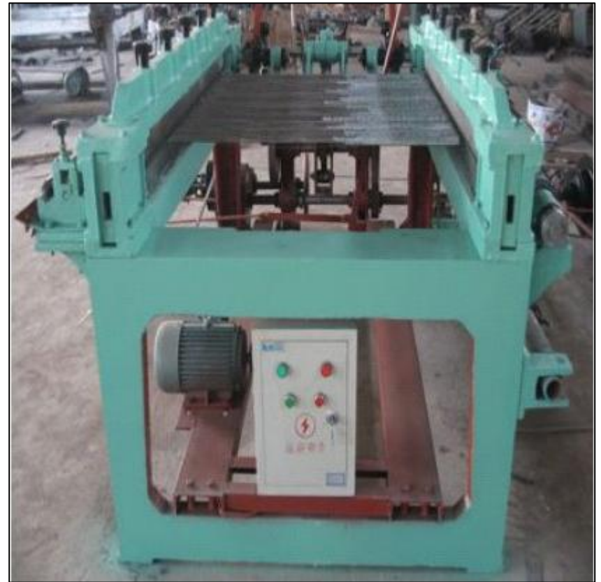
Lateral of the machine